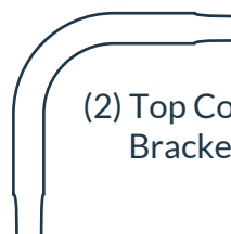
(2) Top Corner Bracket