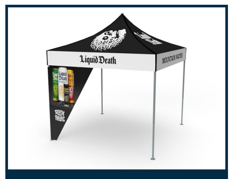
Long Triangle Leg Panel

In addition to our peak flags, TentCraft is now offering 3 new add-ons for the MONARCHTENT: