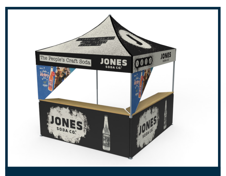
Short Triangle Leg Panels