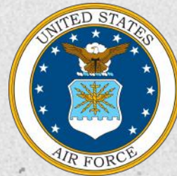
Dept. of the Air Force