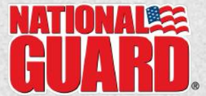
Various National Guard Units