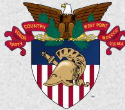
US Military Academy West Point